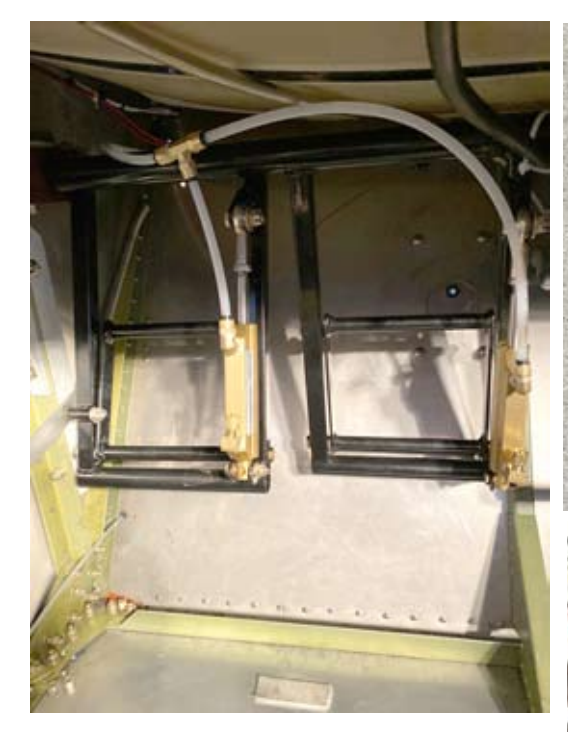
New Toe Brakes installed

Spent a stupid amount of time polishing the Waiex skin to look as good as Doug Boyd's plane, only to pretty much fail.