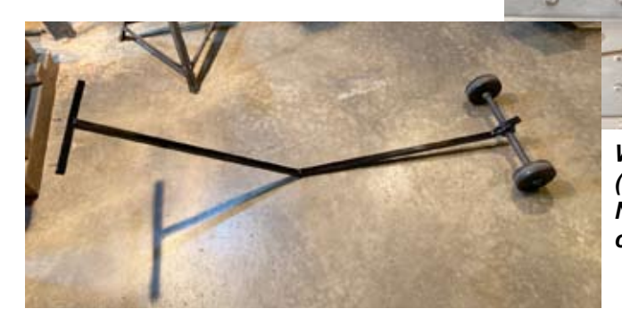
Welded up Tail Dolly (left) New tail wheel installed compared to old. (right)