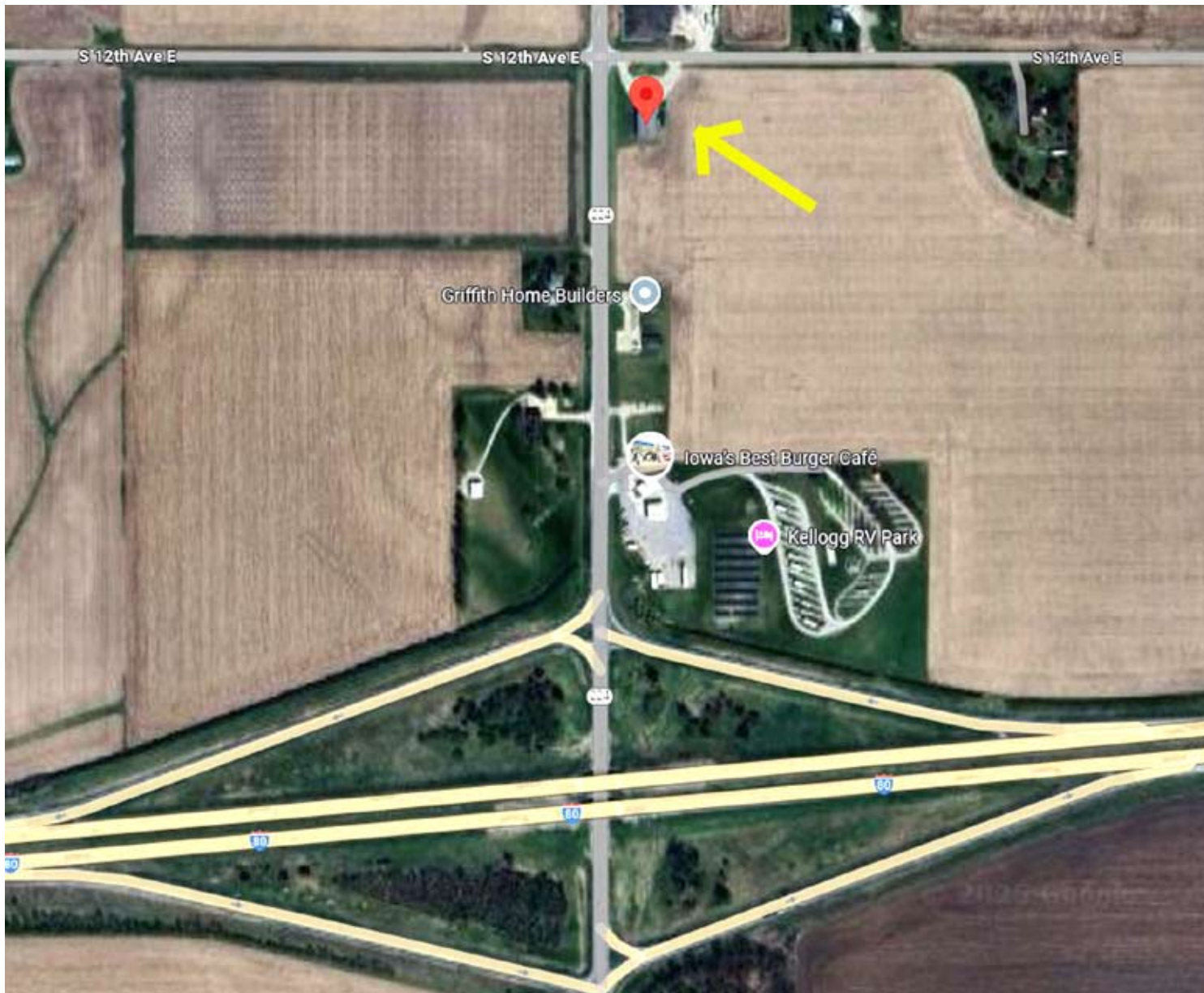
The L3 Project is North of the Kellogg exit about a half mile. Address is... 10185 S 12th Ave E. Kellogg, IA