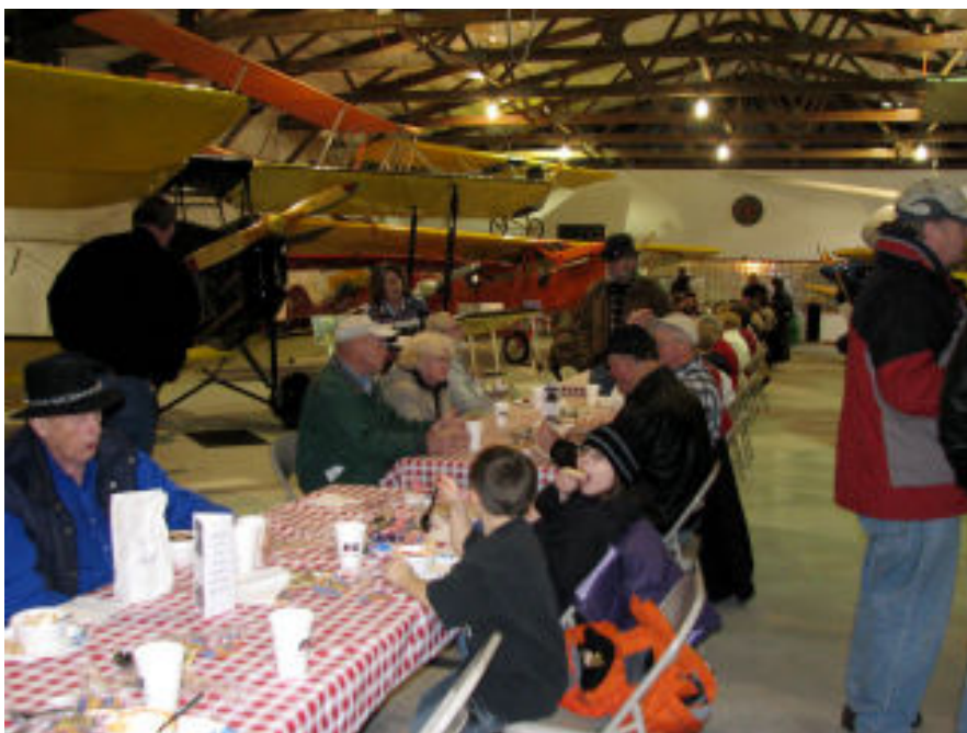
Food and Airplanes...doesn't get much better than this!

If you have never been to the museum, it is really worth the trip.