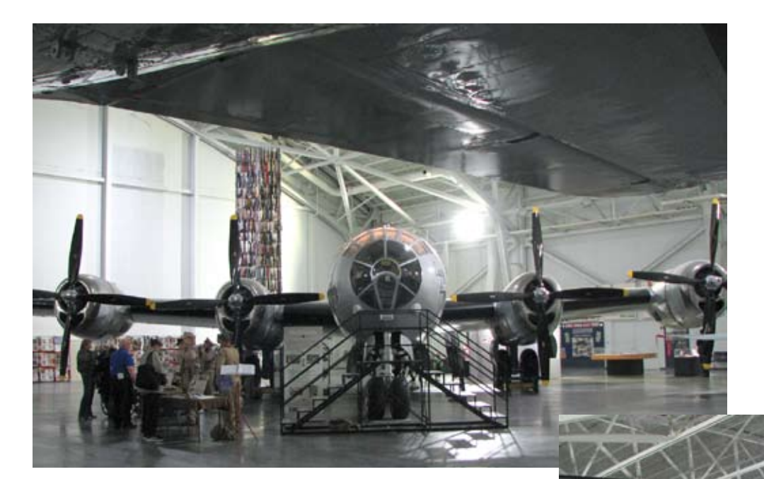
This B-29 "Lucky Lady", was the first airplane to circumnavigate the globe non-stop. It was refueled by another B-29 while inflight.

There were these two helicopters, as well as a U2, a P-33, an F-84 and F-86 hanging from the ceiling.